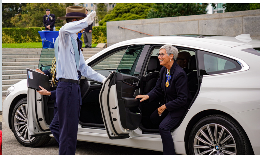
Her Excellency the Honourable Linda Dessau AC, CVO, Governor of Victoria is welcomed to an Anzac Day event by No. 415 Squadron as they supported the Melbourne Legacy Students' Service at the Shrine of Remembrance.