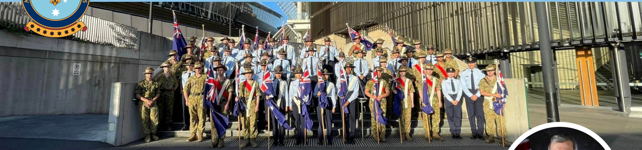
Australian Army Cadets, Australian Air Force Cadets, Navy Catafalque party at the National Rugby League Anzac Day match, 2023